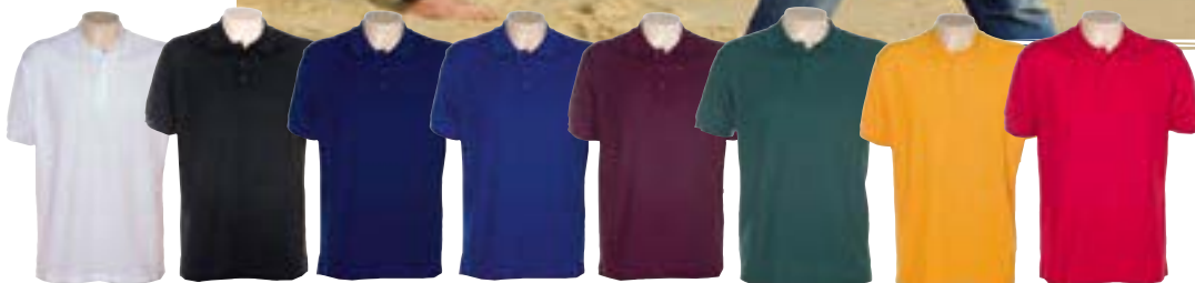
white black navy royal burgundy bottle green gold red