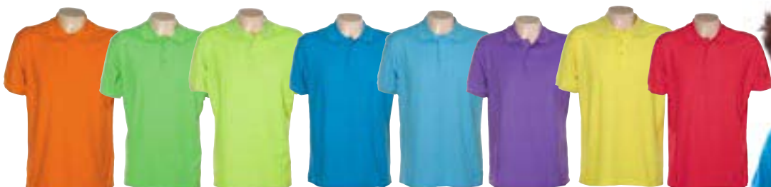
tangerine apple green lime hawaiian ocean bachelor blue purple yellow melon